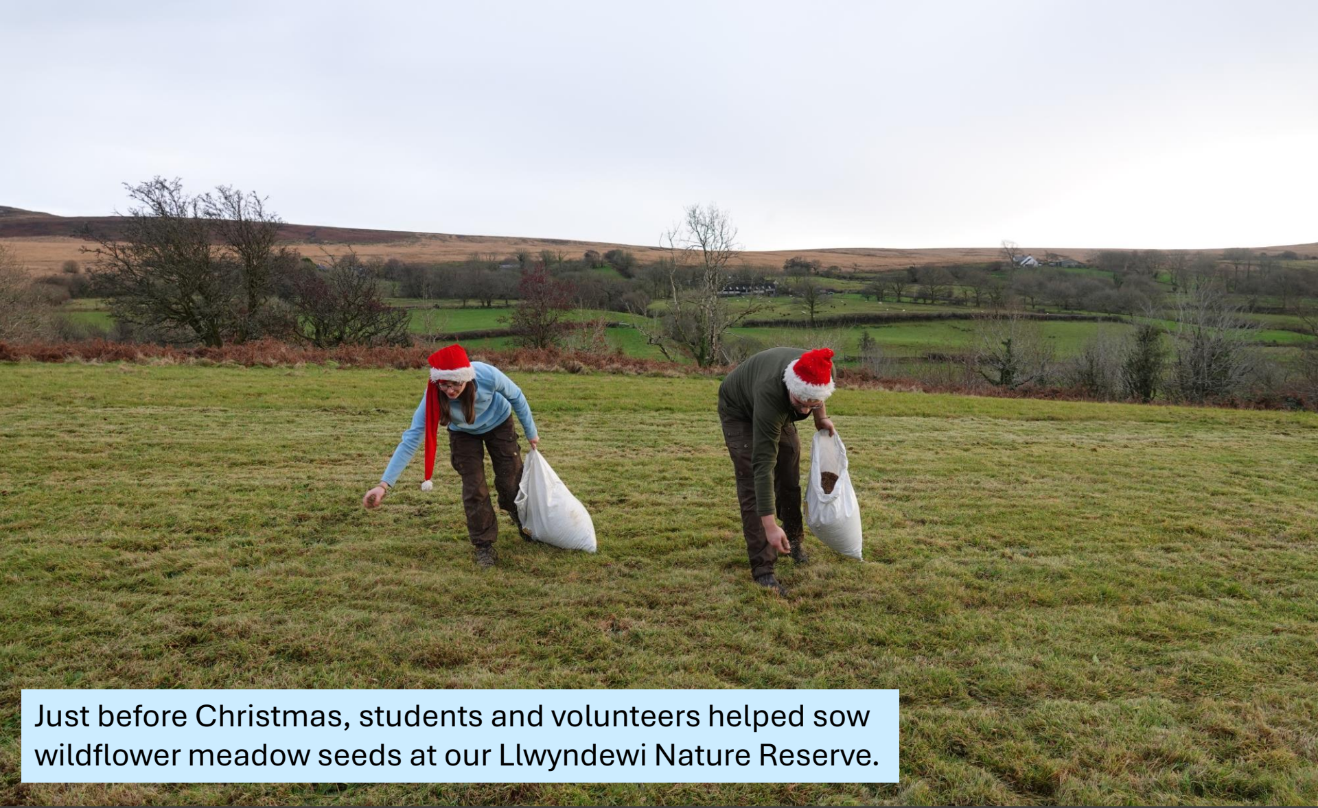
Just before Christmas, students and volunteers helped sow wildflower meadow seeds at our Llwyndewi Nature Reserve.